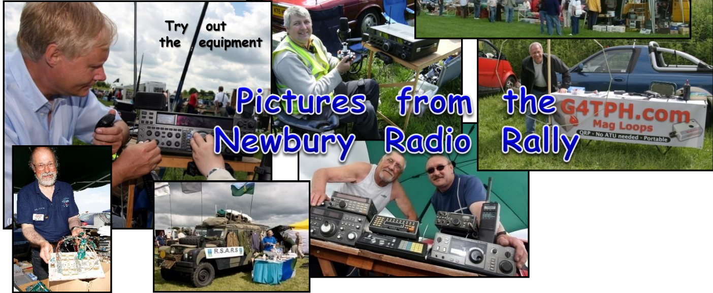
Traders and displays as far as the eye can see!

There are many facets to amateur radio; a popular one at NADARS is contesting , and the club has an excellent track record of results. Events vary, but the basic principle is to make as many radio contacts as possible in a specified period of time. A very popular series of contests runs regularly each month where members operate from home and individual scores are added to make a club total.