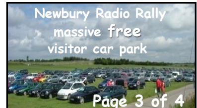
Newbury Radio Rally massive free visitor car park