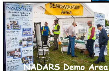
NADARS Demo Area